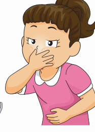
NAUSEA OR VOMITING